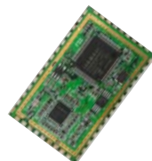
FS2207 Transmitter Module