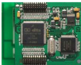
Dolby Digital Decoder Board with DSP and MCU

By leveraging on FreeSystems existing hardware and DSP firmware, this off-the-shelf product will help CE manufacturers to realize their wireless audio products or applications rapidly, without the need to understand RF or develop any embedded firmware.